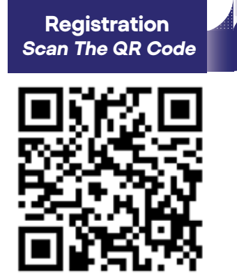
Registration link: https://forms.office.com/r/Atuk3gdMK7

Venue : Training Centre, Pertubuhan Ikatan Komuniti Selamat, Menara Ecoworld, Bukit Bintang City Centre, No. 2, Jalan Hang Tuah, 55100 Kuala Lumpur